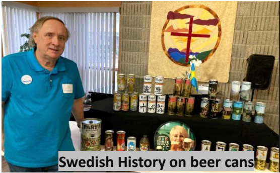
Swedish History on beer cans