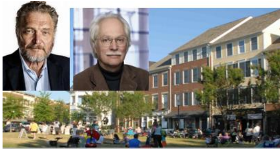
Swedish architecture for urban development