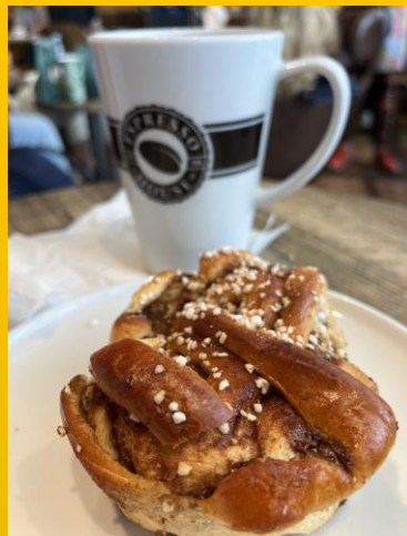
DAILY FIKA – KAFFE & BULLE