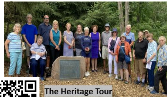
The Heritage Tour